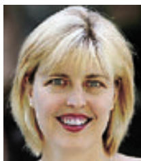
Around the Market

By the time you've run downstairs to head out the front door, the fire has already engulfed the back of the house. And all you can do is go outside and watch the house that you've lived in for more than 18 years go up in flames.