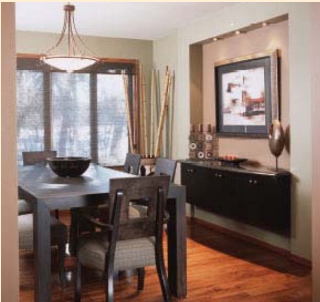
A bamboo Hunter Douglas's Allustra Roman shade complements the Oriental elements of the space.