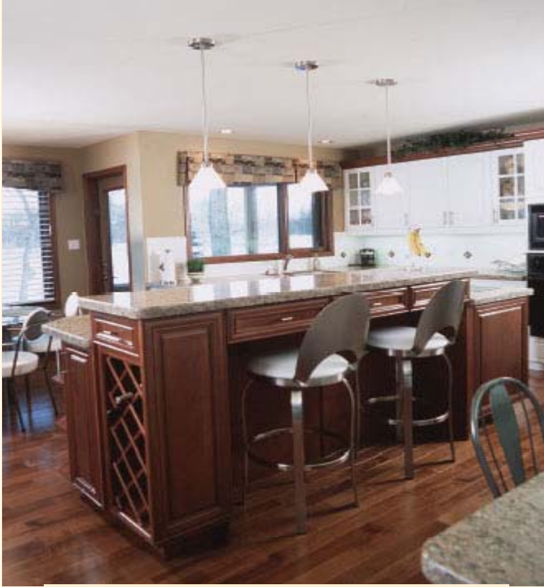
KDR removed the old four by four foot island and arranged for Kitchen Craft to install a luxurious two-tiered island with a bar sink and built-in wine rack.

Dansereau wanted to give the kitchen a new look without replacing all existing cabinetry. A beautiful island with a raised breakfast bar, undermount bar sink and range replaced the former unit. The light box was exchanged for pendant lighting. Black laminate countertops were replaced with granite that worked well with the décor. Instead of redoing the entire backsplash, the black diamond details were ingeniously covered with thin granite cutouts. Final touches included exchanging the solid pantry door with a glass French door to lighten the space, and adding a crown moulding to match with the flooring. Existing window treatments were replaced by Hunter Douglas Alouettes, a louver blind system that combines the look and function of shutters with the