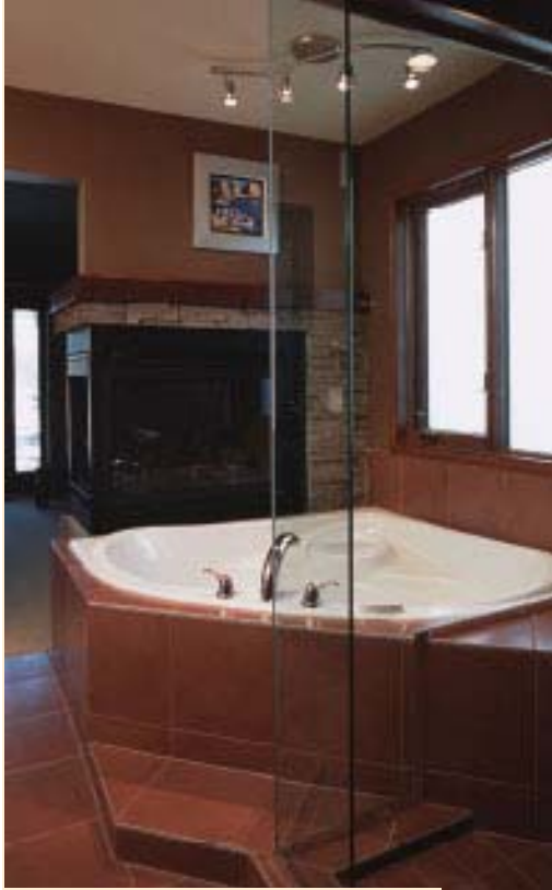
KDR created an open concept bathroom with tile selected by Interior Illusions to create a sleek look.

Redoing the master bedroom and ensuite was another priority on the couple's wish list. They wanted a gas fireplace, a corner tub, a frameless shower and doors to the deck. "This was very challenging with the limited space we had to work with," says Diego Vassallo, who designed an open concept to the ensuite using a three-sided fireplace and a state of the art corner air tub with the tile deck extending into the frameless shower to create a seat. The bedroom window was replaced with functional sidelights and garden doors. "It's a great feeling to wake up and walk onto the deck from our bedroom to take in the river view before our hectic day begins," say the Dansereaus.