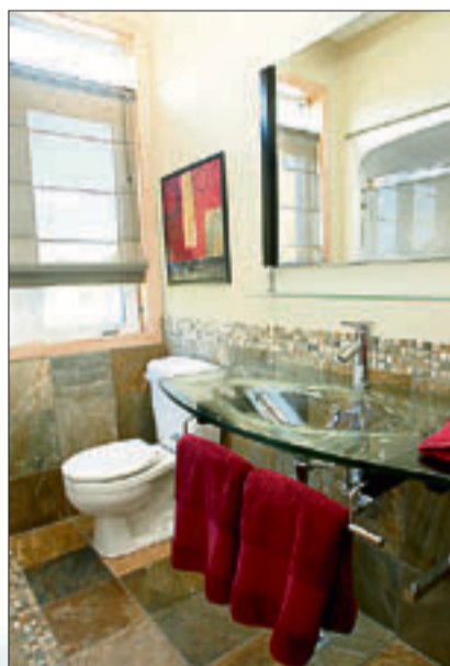
Windows, windows, windows: KDR Design Builders would have had trouble trying to put in more than the 56 this home has. The effect is rich and airy.