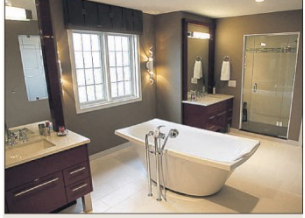
Standalone tub adds nice touch to bathroom