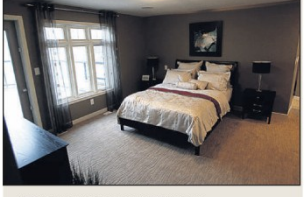
Master bedroom is spacious and inviting