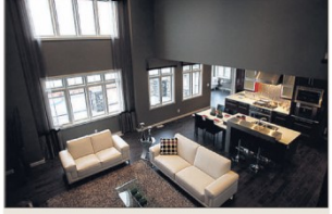
Great room features an 18-foot ceiling