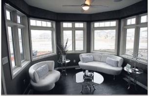
Sunroom leads to a huge backyard deck

ADDRESS: 15 Prominence Point, Bridgwater Forest STYLE: Two-storey, with walk-out basement on lake SIZE: 2,984 sq. ft. with 1,500-plus sq. ft. in lower level PRICE, AS SEEN: $1,462,000 (including lot, appliances & net GST) LOT SIZE: Pie shaped; 185' x 78' CONTACT: David De Leeuw @ 989-5000 or dddavid@mts.net